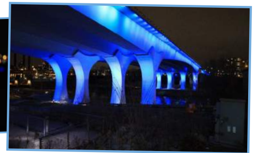
2016 Building Blue Bridges